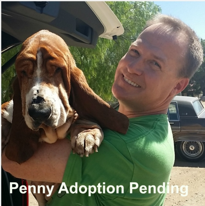
Penny Adoption Pending