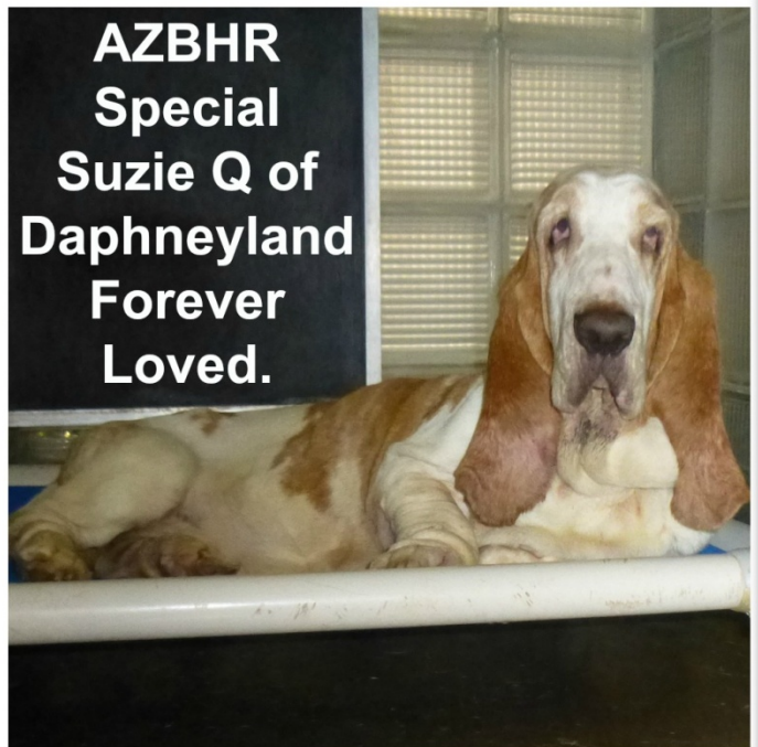
AZBHR Special Suzie Q of Daphneyland Forever Loved.