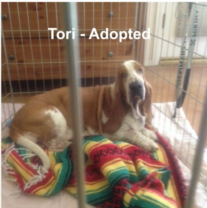
Tori - Adopted